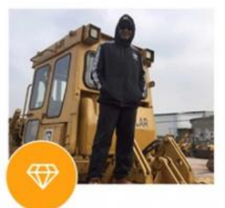
Massive inventory The best price and