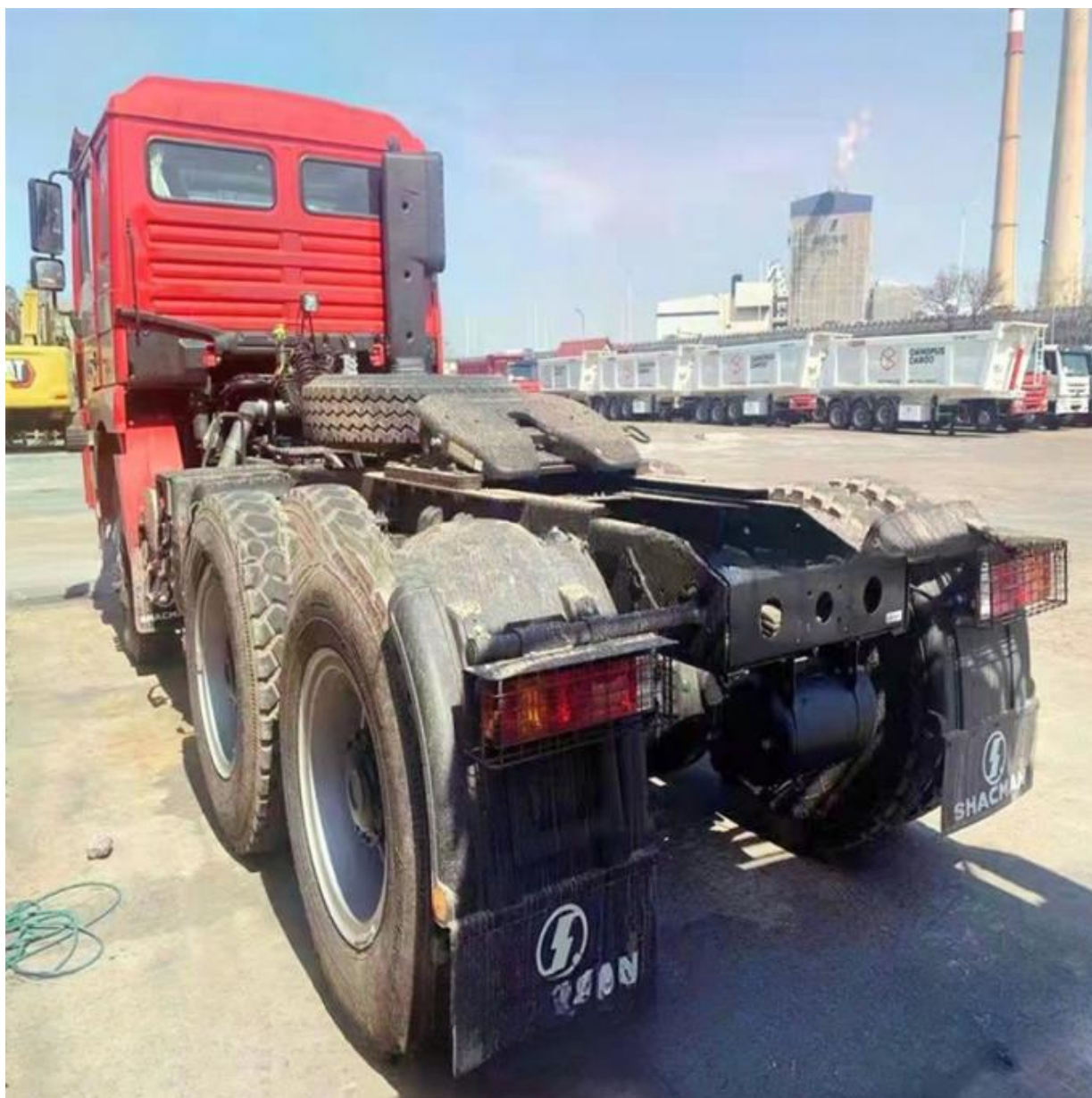
Shacman F3000 6X4 tractor truck with 420hp Cummins Engine