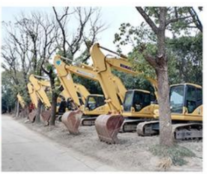
Professionals do professional things. If you are looking for the most cost-effective,

Our main business is construction machinery, such as crawler excavator, wheel excavator, bulldozer, loader, grader, forklift, dump truck, transport truck, truck mixer, concrete pump, backhoe loader, truck crane, etc